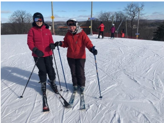
Feb. 14 - Edelweiss

While snow depth was a challenge on some runs, all ski hills were able to keep the ski season going right up to the last week of March, and our downhill club members enjoyed every day we went out with some of the best weather conditions in years.