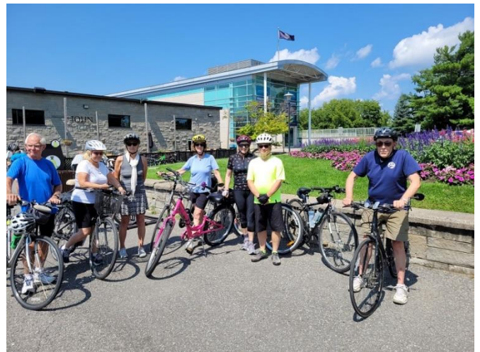
Aug. 18/23 – Cycling to Rideau Falls