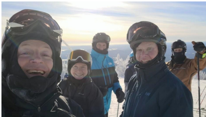
Jan. 19 – Tremblant bus trip

We also kept our popular “Fortune Fridays” event going – an informal weekly Friday meet-up at Camp Fortune for members, family, friends and for those just wanting to take a “Me Day” off work.