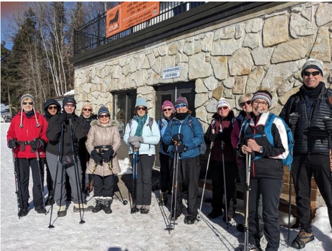
Feb. 14-16 – Midweek at Far Hills Inn