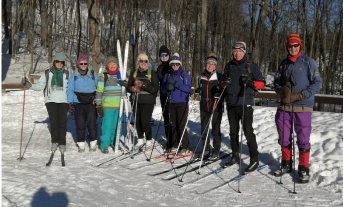
Jan. 20 – XC ski to Pink Lake

The cross-country ski day trips were supposed to start on December 16, and finally got underway on January 14. Eight of the 22 planned day trips went ahead (and one of those became a hike), with cancellations due to poor weather conditions or lack of snow. The group sizes ranged from 4 to 12 participants per outing. Our final official outing was on February 24.