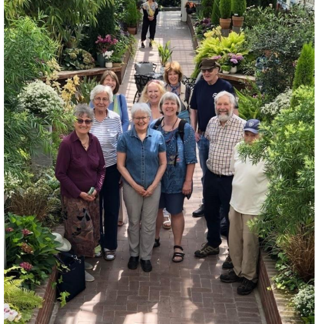
June 3/23 – Governor-General's residence & greenhouses