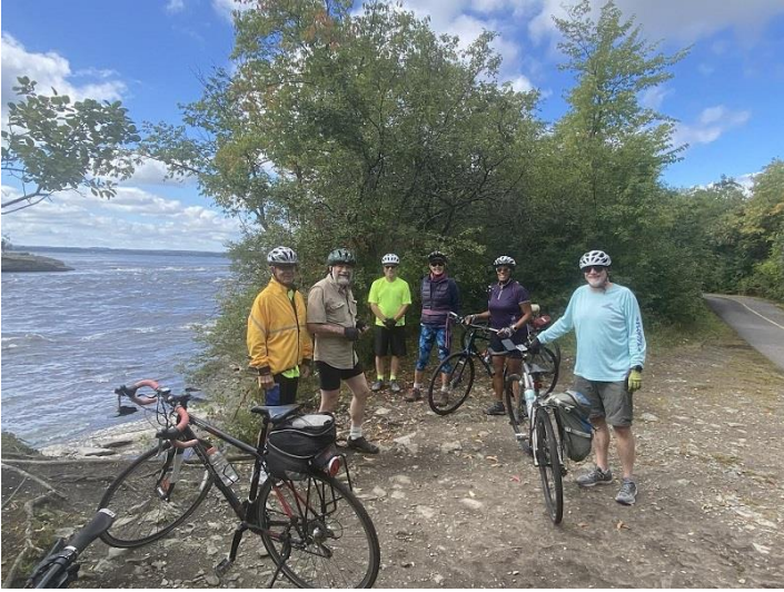
Sept. 13/23 – Cycling to Aylmer marina