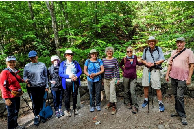
Sept. 16/23 – Lauriault trail

Thanks to our RA Ski photographers for providing us with some great pictures of our weeklong, weekend and day trips.