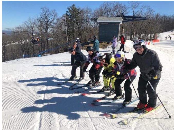
Mar. 8 – Camp Fortune

This was a win-win for both clubs, as the RA Ski Club helped fill their bus, and the Bytown Ski Club got to park their cars in the RA’s lot, as well as meet at the RA.