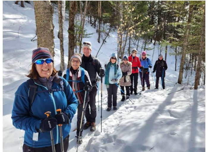
Feb. 14 – 16 – Hikers at Far Hills

RA skiers returned to Far Hills Inn this February 14-16 for a mid-week, multi-day trip. Twenty-five of us enjoyed each other’s company and some outdoor activities.