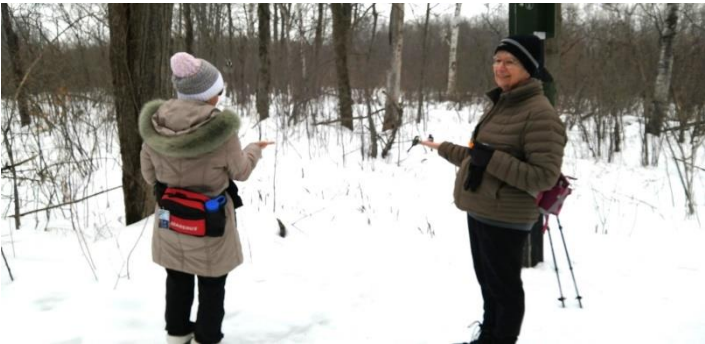
Jan. 31 – Hike at Mer Bleu