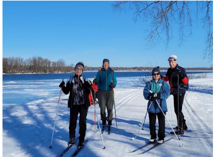
Feb. 6 – Ottawa Heritage East trail