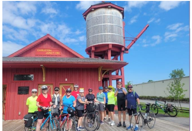
Aug. 16/23 – Cycling to Almonte