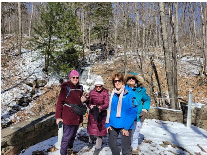
March 21 – Hike on Lauriault trail