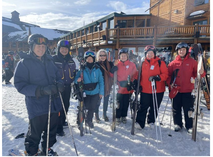
Feb. 2024 – Banff weeklong – Skiing at Lake Louise