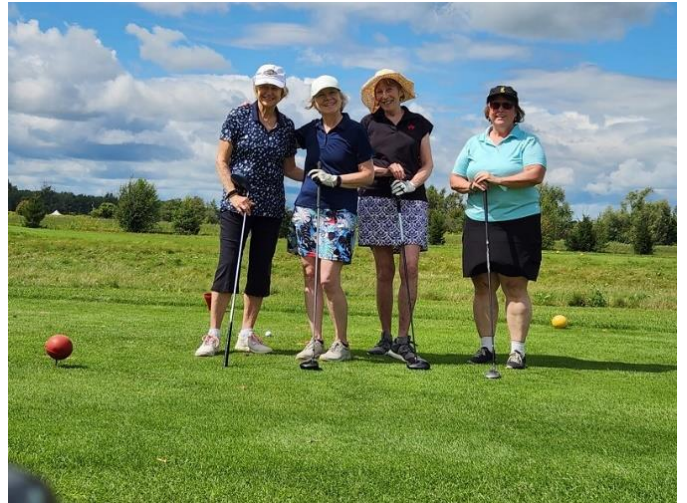
Aug. 12/23 – Golfing at Anderson Links