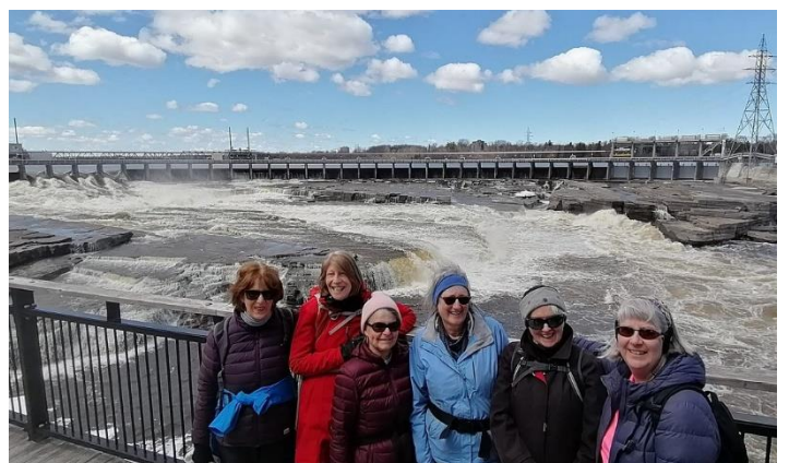
Apr. 6 – Hike to Chief Commanda Bridge