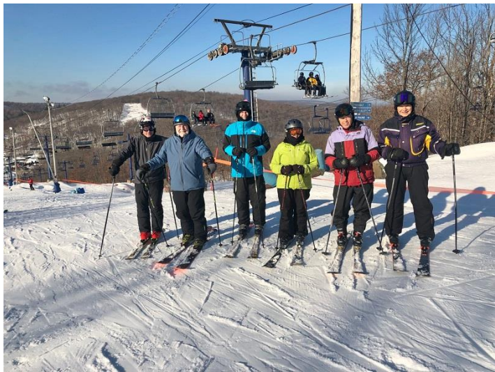
Dec. 15 Camp Fortune - First DH ski of the season

As I look out my window the first week of April, I see more snow on the ground than most of February & March !!