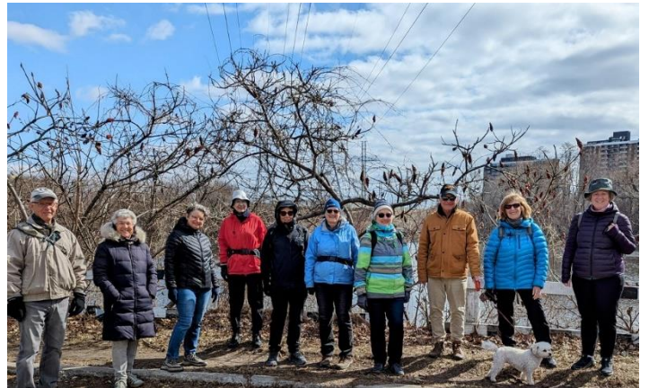
March 28 – Hike Ottawa East