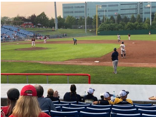
June 30/23 - Ottawa Titans baseball