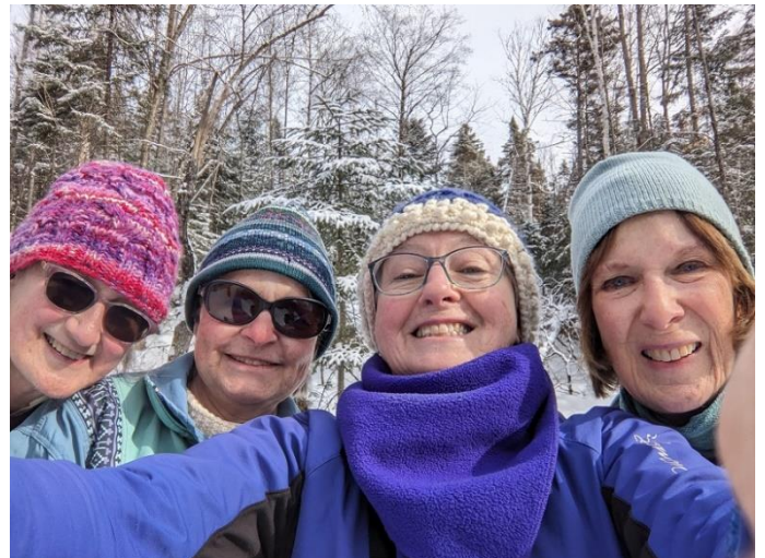
Feb. 14-16 – RA Skiers at Far Hills

Ski conditions were not very good and only a few of us put on our skis for, perhaps, shorter than usual skis. Most of us enjoyed fantastic walking conditions on some of the snowshoe trails where we were treated to great views and even a pileated woodpecker! No snowshoes were needed, but cleats worked well! A few people did head out to Le Petit Train du Nord and skied! A light snow on Thursday night did improve conditions on some of the trails.