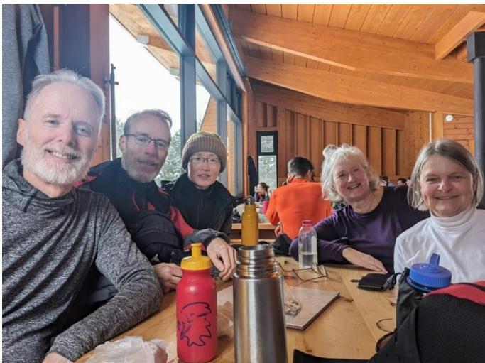
Jan. 14 – Taylor Lake ski, stop at Renaud cabin