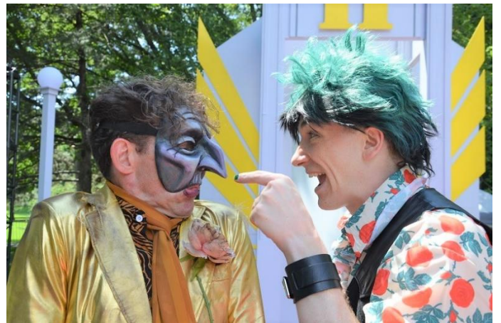
Aug. 2023 - Odyssey Theatre production “The Miser”