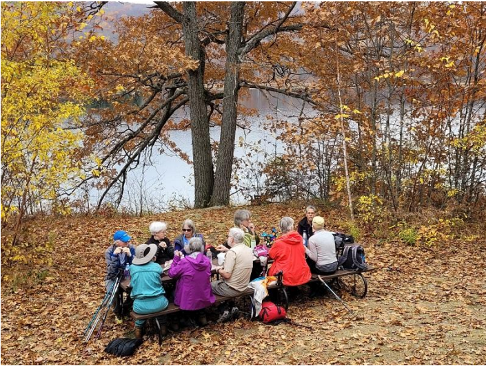
Oct. 26/23 – Hike to Lusk cabin