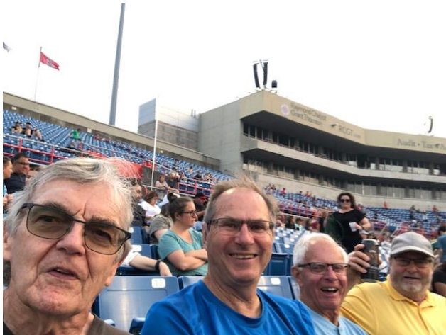
June 30/23 - Watching a baseball game