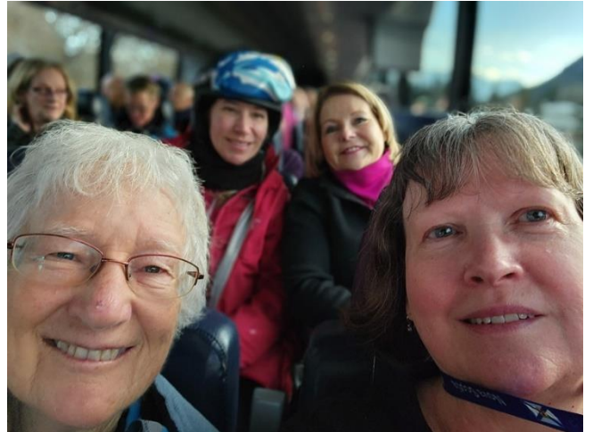
Feb. 2024 – Banff weeklong – On the bus