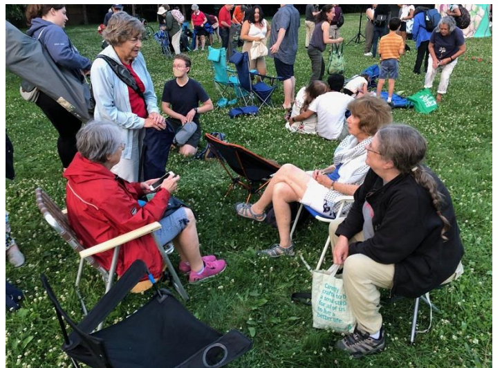
July 14/23 – Company of Fools “Hamlet”