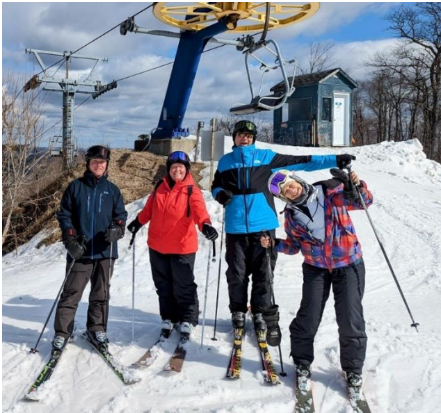
March 15 – Fortune Friday