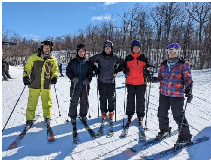
Feb. 21 – “Pop-up Ski” at Camp Fortune

While the pre-Christmas downhill schedule had to adjust to a late season start, our day trips afterwards made up for it.