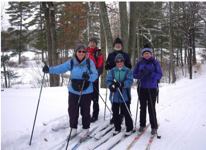
Jan. 14 – Taylor Lake ski

For next season, let us know your favorite routes, or trails that you have always wanted to try (including those outside of Gatineau Park and the city) and if you are willing to lead any day trips. Also, we would appreciate feedback about whether to meet up at the RA Centre to facilitate car-pooling, or to continue to meet at the trail heads.