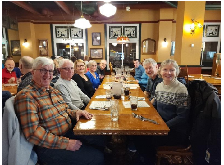
Feb. 2024 – Banff Weeklong