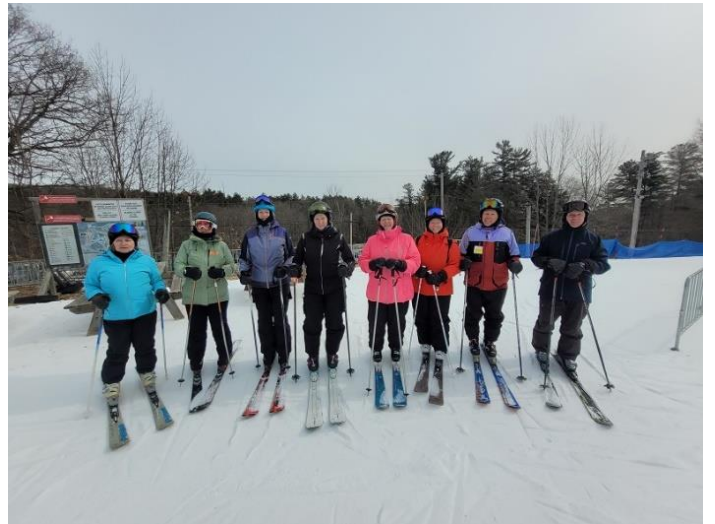
March 22 – Fortune Friday