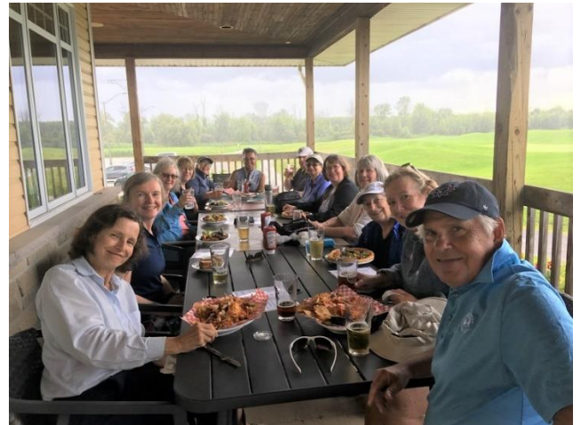
Aug. 13/24 Golf – 9 th hole at Anderson links