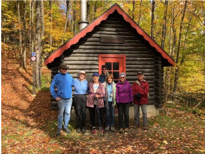
Oct. 12/23 – Hike to Shilly Shally cabin

Hello RA Ski Club Members! After a banner year of 34 hike and bike outings in 2023, the RA Ski Club is gearing up for another successful hike and bike outing season. My thanks to all our generous volunteer leaders who have stepped up to lead a hike or bike outing this spring...we couldn't provide these recreational opportunities to our members without your input. If you would like to lead a hike or bike outing over the summer or into the fall, please get in touch.