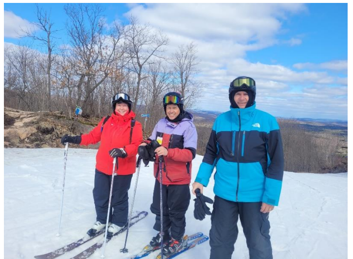
March 29 Camp Fortune – Final DH ski of the season