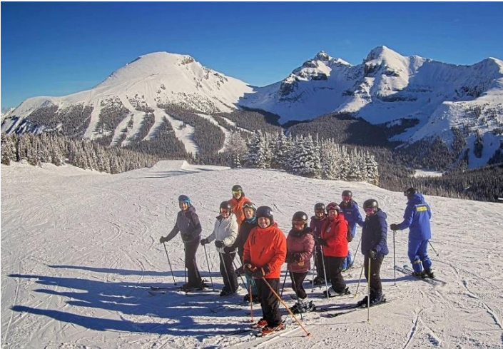
Feb. 2024 – Banff Weeklong – skiing at Sunshine