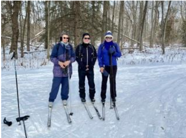
Feb. 21 – XC at Leitrim Road – Final XC ski of the season