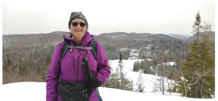
Feb. 2023 – XC skiing at Far Hills Inn