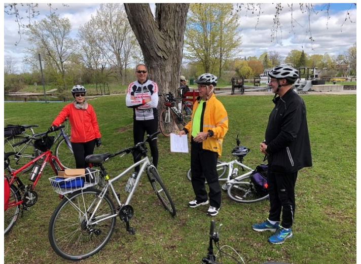
May 2019 – Roger’s Roddle in Merrickville

Hello RA Ski Club hikers and cyclists! Thanks to our great volunteer leaders, we have a large number of fun bike and hiking outings lined up for the spring, summer and fall of 2023. Be sure to check the RA Ski Website and Facebook page for more specific details – meet-up location, time etc. – and for possible cancellations due to weather.