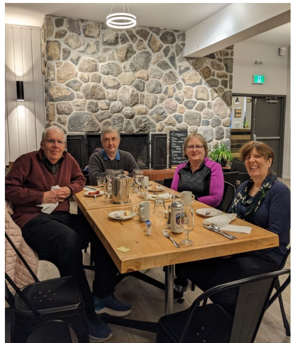
Dinner at Far Hills Inn

RA skiers and snowshoers returned to Far Hills Inn this February 8-10 for a mid-week multi-day trip after many years of absence. Thirty-one of us made the trip in fantastic ski weather to enjoy the trails. The inn provided a dining room in which much socializing occurred, before, during and after meals. It was great being together again.