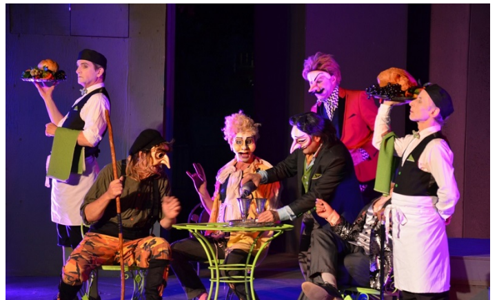
Odyssey Theatre production