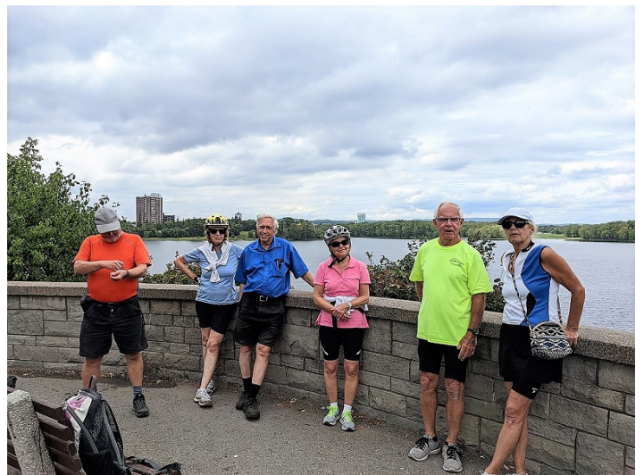
Sept. 12 2022 – Cycling to Tavern on the Falls