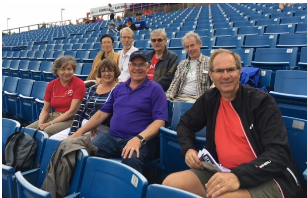
Watching a baseball game