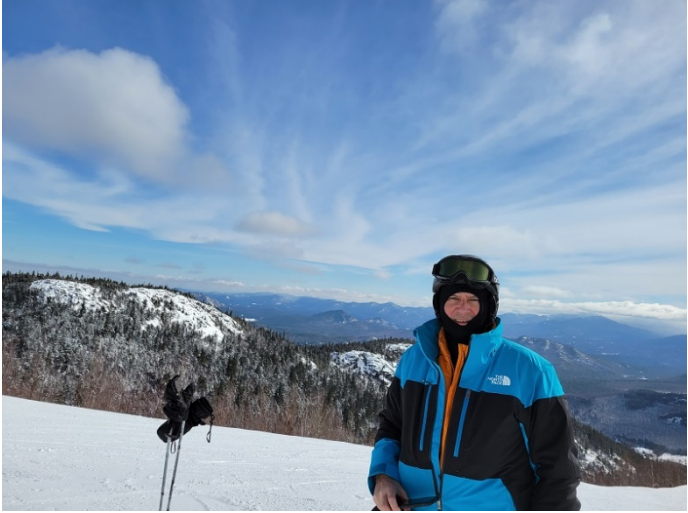
Feb. 23 2023 – DH Skiing at Whiteface mid-week