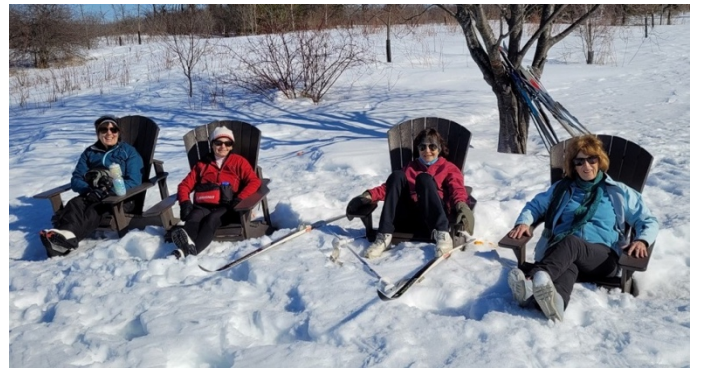
Feb. 14 – Heritage East trail