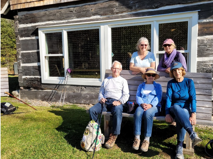
Nov. 2022 – Hike to Healey cabin