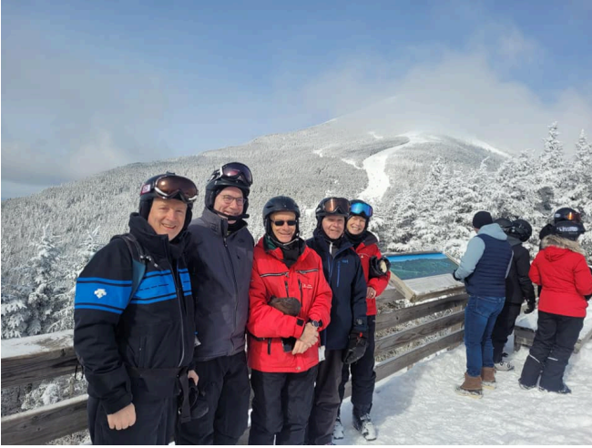
Feb. 2023 – Mid-week at Lake Placid