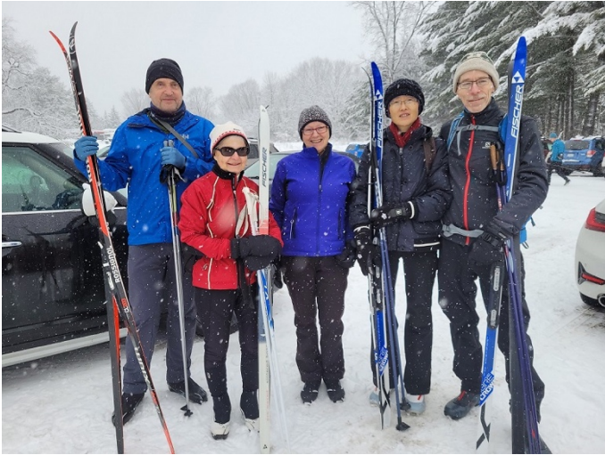
Dec. 17 – Our first XC of the season! P8 to P9

The cross-country ski day trips started off on December 17 in Gatineau Park, the day before the official season opened in the park.