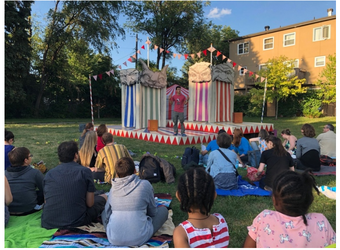
Company of Fools