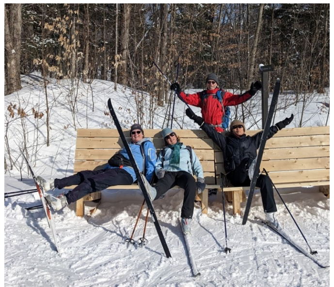
Feb. 26 – XC ski to Pink Lake