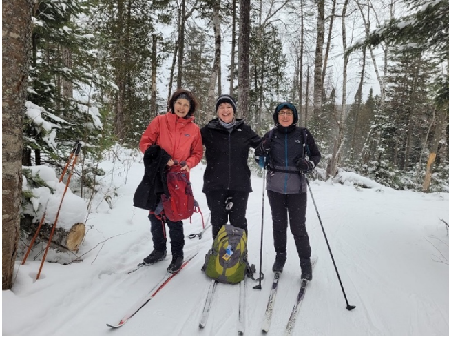
Feb. 2023 – XC skiers on Lake Placid trip

Having skied Whiteface not that many years ago when it was sarcastically called “Iceface”, the improvements in snowmaking and lifts are very noticeable. Driving conditions were good on the way back, and we all made it home safe & sound.