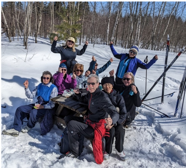
Mar. 6 – XC ski at Larose Forest