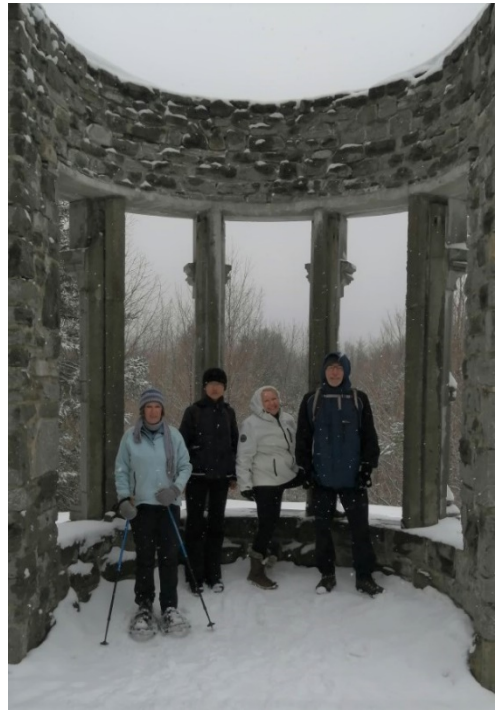
Mar. 16 – 2 nd part of our Biathlon

Thanks to our RA Ski photographers for providing us with some great pictures of our weeklong, weekend and day trips.