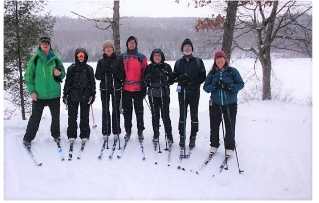
Dec. 26 – Taylor Lake trail

We plan to add some more day trips for next season, so tell us about your favorite routes, or trails that you have always wanted to try. We are also looking for more trip leaders. Thanks to those who have already sent in some suggestions.