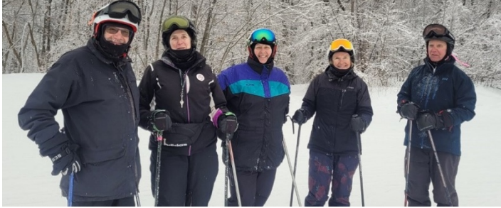
Jan. 9 – Pop-up DH ski at Camp Fortune

We also put “RA Ski Photos of the Week” on our home page raski.ca .