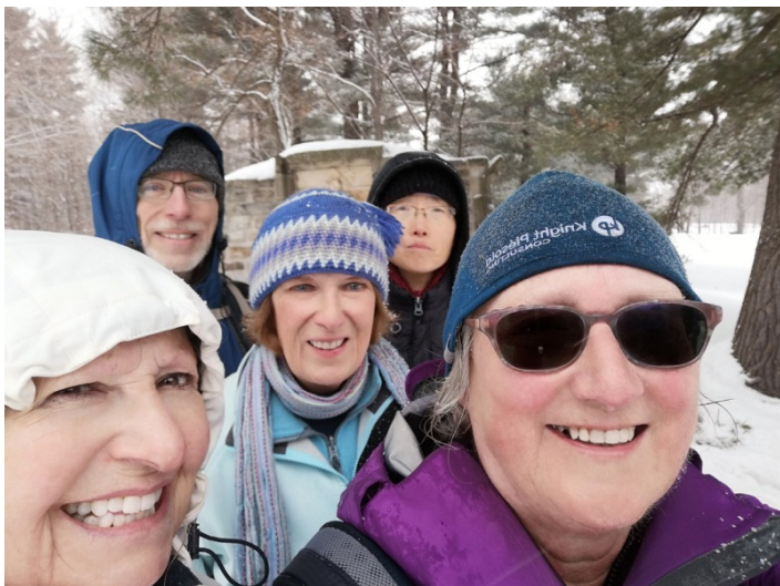
Mar. 16 – Participants in our 2023 Biathlon