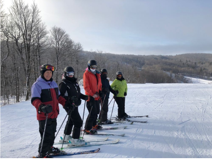
Dec. 20 2022 – Camp Fortune – 1 st DH ski of the season