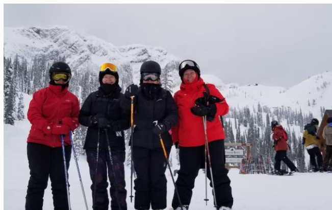
Feb. 2022 – Weeklong trip to Fernie BC

NOTE: Many ski hills have web cameras where you can see the current weather, crowds, and ski conditions all in real time.