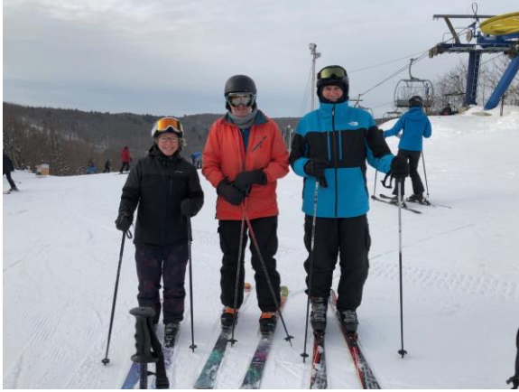
Dec. 22 – Meet'n'Ski at Camp Fortune

We managed to make it out twice on the week before Christmas and were happy just to feel snow under our skis despite very few runs open.