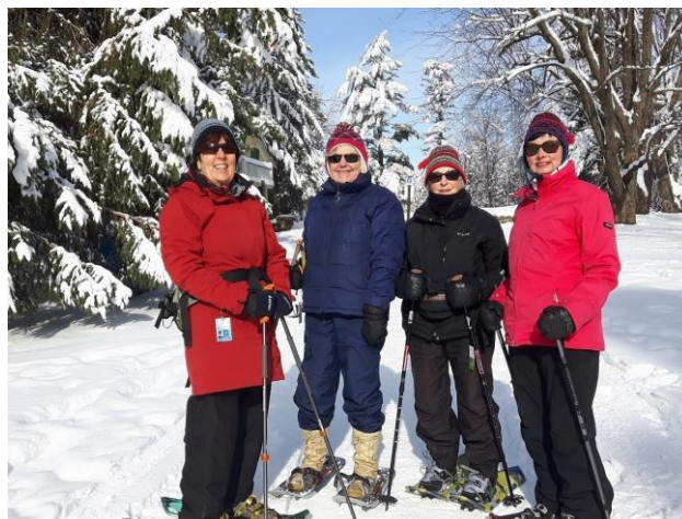
Jan. 2020 - - Snowshoeing at Lauriault trail

The RA Ski Club is a member of the RA Centre – 2451 Riverside Drive, Ottawa K1H 7X7 - 733-5100 – www.racentre.com