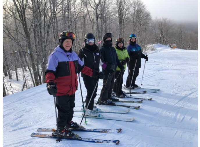
Dec. 20: Pop-Up Ski at Camp Fortune

We have last-minute pop-up skis if conditions look good on a particular ski hill. Watch our website and Facebook page.