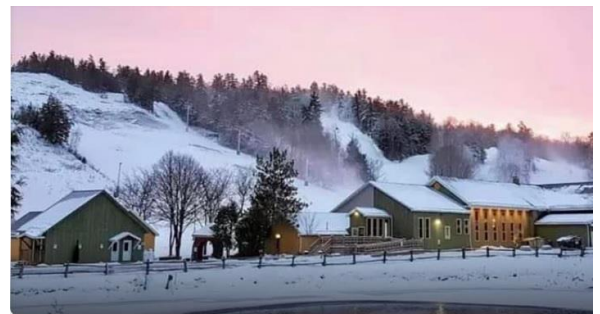
RA Ski & Outdoor Club of Ottawa

Visit us on Facebook to learn about upcoming events, read members' comments, and much more! Go to RA Ski and Snowboard Club of Ottawa and ask to join.