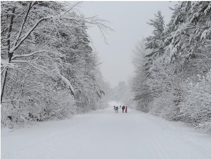
Dec. 17 – On trail P8 to P9

Thanks again to our volunteer trip leaders. Keep an eye on the club website and Facebook page for details about the cross-country ski day trips. Let's hope for a good season.