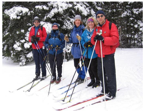
2008 – RA skiers at Far Hills