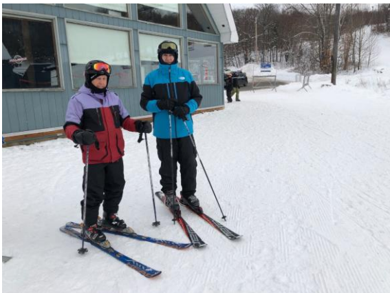
Dec. 22 – Meet'n'Ski at Camp Fortune

Our ski club is not alone in this regard as other similar clubs in our area have severely cut back on bus trips or are no longer offering bus trips. We hope this situation will change but we are not looking at this travel option for this ski season.