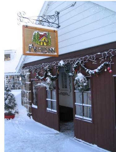
Far Hills Inn

This trip is fully booked! The 34 participants are looking forward to the trip!