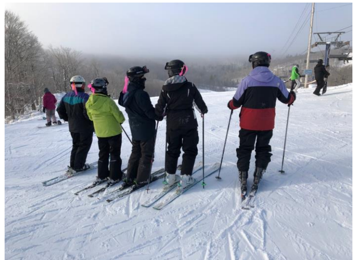
RA skiers with a pink ribbon on their helmets

If you're new to the club and don't know anybody, look for people wearing a pink ribbon on their helmet.