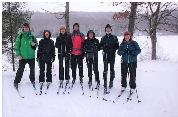
Boxing Day 2022 – XC Ski from P20 to Renaud cabin