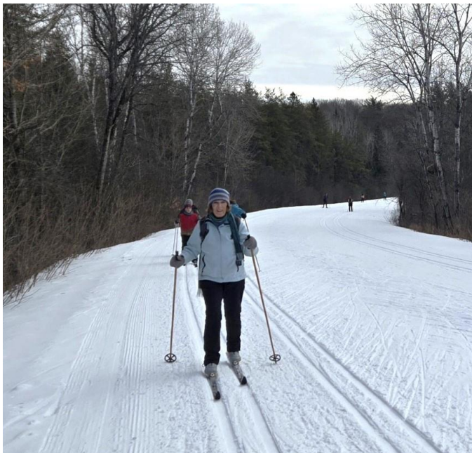
Jan. 11 – RA skier on P8 to P9

Thanks goes out to our patient and flexible trip leaders. Hopefully, by the time this newsletter is published we will have been able to get out for some skiing.