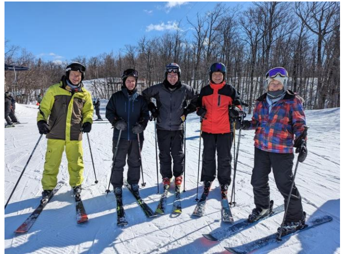
Feb. 26, 2024 – Meet'n'Ski at Camp Fortune