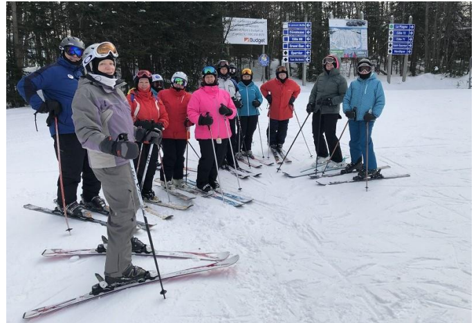
Jan. 14, 2019 – Bus trip to St-Sauveur