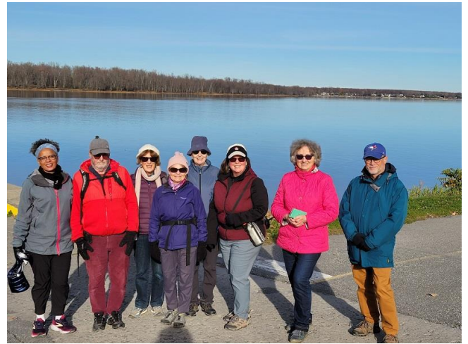
Nov. 3 – Hiking Ottawa River East