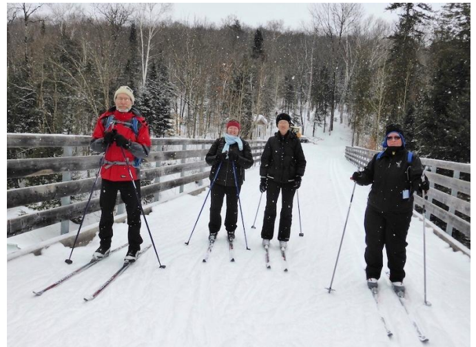
Feb. 2017 – XC skiing at Le Grand Lodge

We have half a room available for a female participant, and although the official registration date is past, please let me know if you are interested in coming along for the fun.