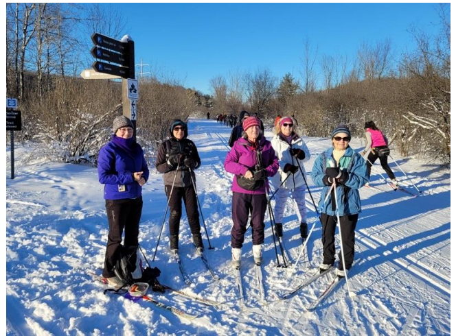
Jan. 15, 2023 – XC ski at Relais Plein Aire