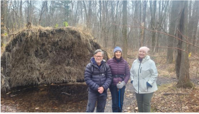
Nov. 28 – Hike in the NCC Greenbelt