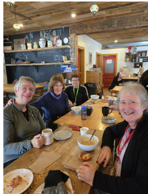
Jan. 11 – Refreshments at Biscotti after XC ski from P8 to P9