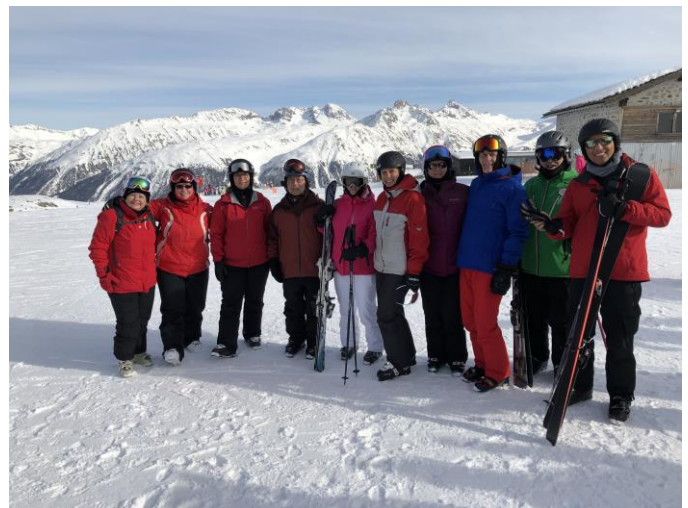
Feb. 2020 – Weeklong at St. Moritz