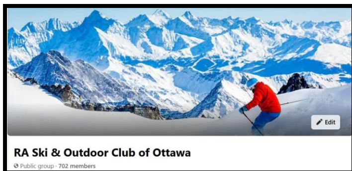
RA Ski Club Facebook Page

Visit us on Facebook to learn about upcoming events, read members' comments, and much more! Go to RA Ski and Snowboard Club of Ottawa and ask to join.