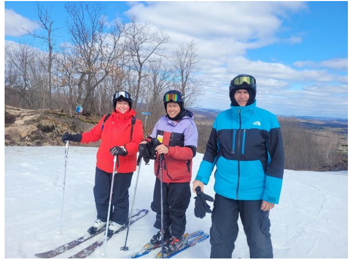
Mar 29, 2024 – Last Fortune Friday of the season