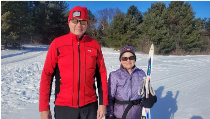
Dec. 14 – Our 1 st XC outing, P8 to P9

Our first outing on December 14th went ahead, with a couple of intrepid skiers who enjoyed surprisingly decent conditions on the Gatineau Parkway.