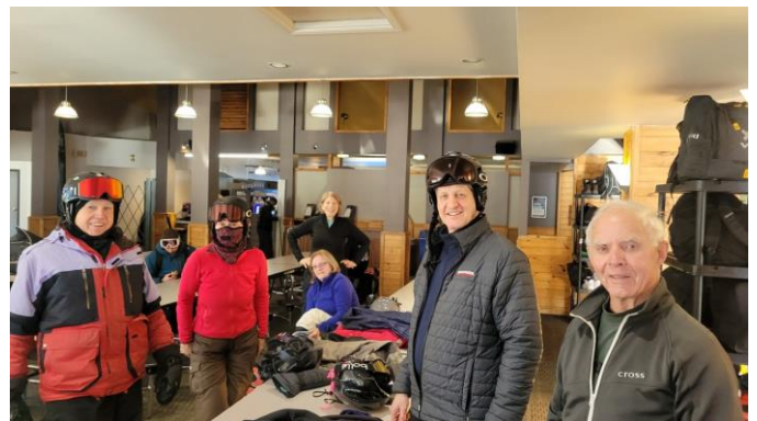
Jan. 10 – Fortune Friday

Details of all our downhill trips can be found at https://www.raski.ca/downhill/downhill-schedule