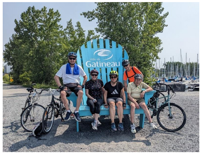
Aug. 14, 2024 – Biking to Aylmer Marina