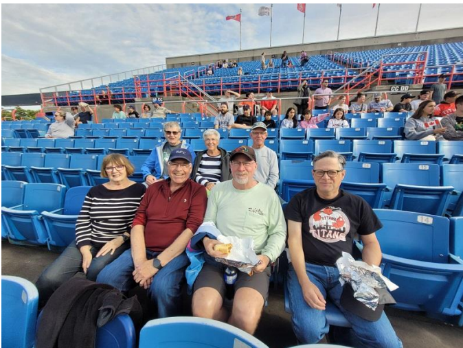
June 29, 2024 – Ottawa Titans baseball game