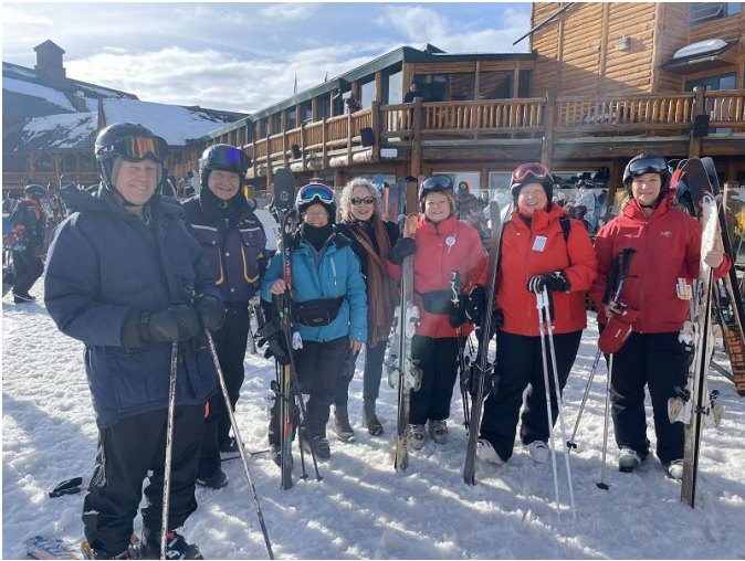
Feb. 2024 – Banff Weeklong – RA skiers at Lake Louise