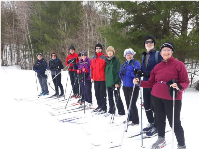
Mar. 5, 2022 – XC ski to Herridge cabin