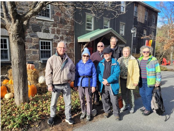
Nov. 12 – Hike to Brown Lake