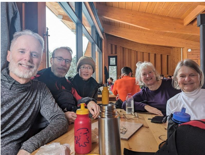
Jan. 14, 2024 – XC ski to Taylor Lake (at Renaud cabin)