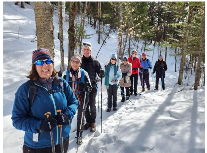
Feb. 2024 – Mid-week to Far Hills Inn