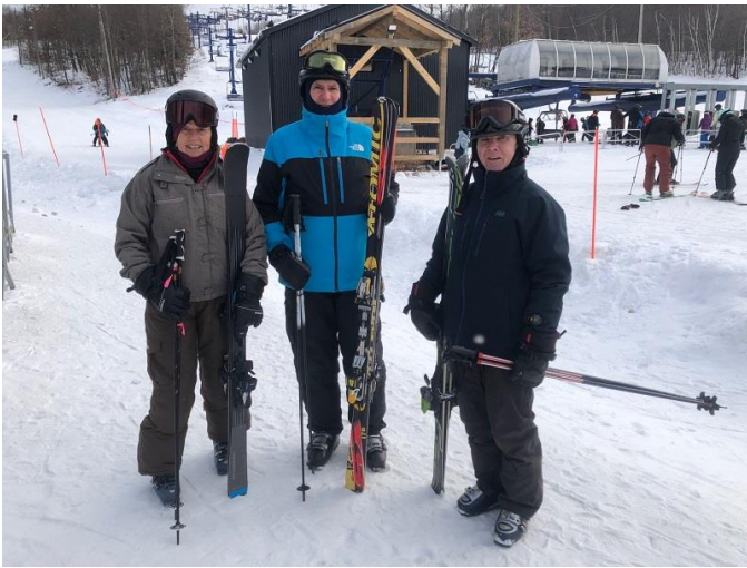
Jan. 3 – Fortune Friday

Our Fortune Friday events – a weekly Friday ski day at Camp Fortune – always gets a good turnout, and we managed to get three of those in before the Christmas break.