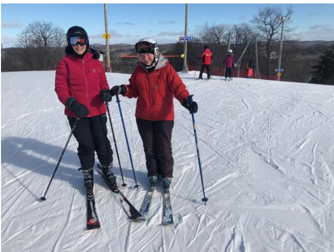
Feb. 14, 2024 – Meet'n'Ski at Edelweiss