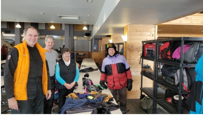
Dec. 6 – Fortune Friday, our first downhill ski of the year

It's been a few years since our first scheduled downhill trip in early December has had enough snow to actually take place, but this year our first trip on December 6th went ahead with three Valley-side runs at Camp Fortune open, and in surprisingly good condition.