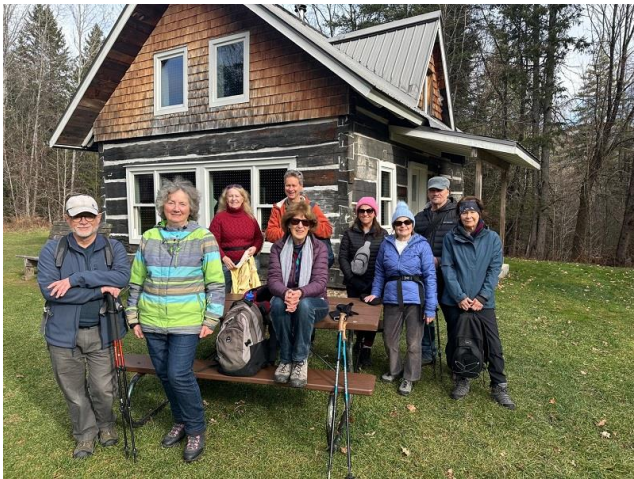
Nov. 19 – Hike to Healey cabin