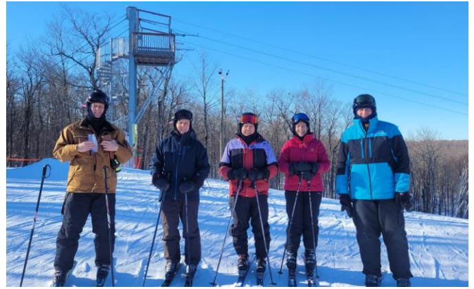
Jan. 10 - Fortune Friday

We've also added an early March multi-day trip to Sunday River, Maine. With 139 runs, 19 lifts, and 2340 ft. vertical, it has a good variety of trails for everyone.